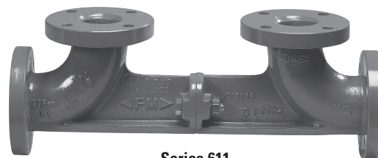
Series 611 U.S. Patent No. 5,392,803

Note: Dimensions shown are nominal. Allowances must be made for normal manufacturing tolerances.